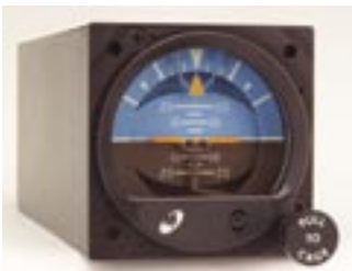
Mid-Continent's 4200 attitude indicator

Mid-Continent, the big name in little instruments, recently introduced its hot new 4200 Series 2-inch electric attitude indicator. Designed to be a “safer” alternative to unreliable vacuum units, the all-electric 4200 is perfect for use as a standby artificial horizon