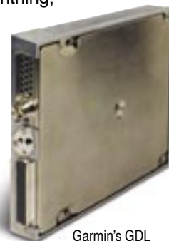
Garmin's GDL 69/69A