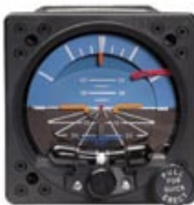
Castleberry Instruments' 2060A

The 2060A is all-metal construction with no plastic parts. It includes an inclinometer and is backlit for easy viewing at night. Available in both 14 and 28 volt