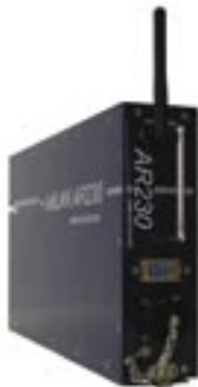
Pentar's JetLAN AR230

and reliable way for passengers to share the aircraft's voice and data connections simultaneously. The unit eliminates the need for additional external networking peripherals such as switches and wireless access points.