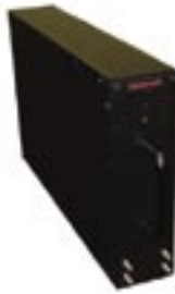
Honeywell's AirSat II

To provide passengers with a total cabin communications solution, the new AirSat II sys-