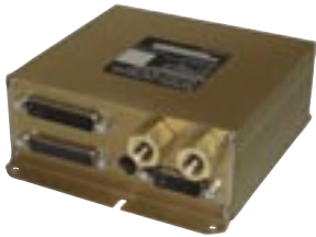
Sandia Aerospace SAC 735 Air Data Computer

735 provides dual RS232 Air Data Outputs, Pressure Altitude, Altitude In-flight Monitoring, ARINC 429 Air Data Outputs, Gillham Grey Code, and more. Suggested list price is $2,495 plus installation. For more information: (505) 341-2930 or visit www.sandiaaerospace.com .