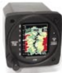
Aspen Avionics' AT300

The 2.5 inch sunlight-readable display shows GPS navigation data from the aircraft's GPS