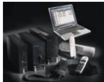
Thrane & Thrane's Aero-HSD+

Global communications technology leader Thrane & Thrane has introduced the latest offering in their high-speed cabin communications family, the Aero-HSD+. The Aero-HSD+ combines the global voice, fax, and PC modem data capabilities of the Inmarsat Aero-H+ services with the new Inmarsat Swift64 aeronautical high-speed data services to