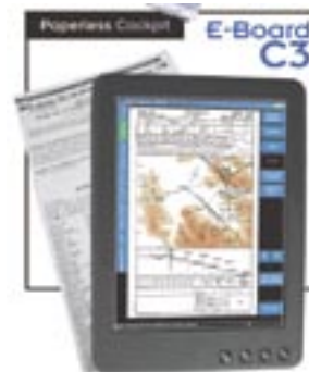
Paperless Cockpit E-Board C3

Speaking of the FlightServe EFB, the company has also introduced the FlightServe C3, Class 2 and Class 3 Electronic Flight Bag. Featuring a 1.6 GHz processor with Centrino technology,