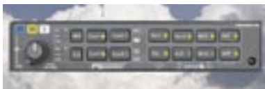
PS Engineering's PMA8000-SR

The PMA8000-SR also features dual entertainment inputs allowing the passengers to listen to SIRIUS entertainment programming, while at the same time the crew can catch up with the latest news. The PMA8000-SR incorporates a "SoftMute" capability that automatically mutes the music when there is a radio call and then smoothly restores the music level. The full-