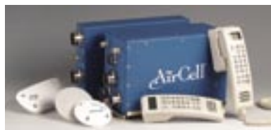
AirCell's Axxess System

Flexibility is the hallmark of the Axxess SmartPhone system. It creates a "smart cabin"—a dynamic wired or wireless envi-