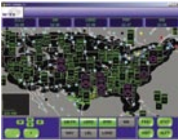
WSI InFlight client interface rev 3.1 showing WSI PIREPS data.

sets 3.1 apart is it is the only product available that can deliver WSI PIREPS into the cockpit. Using patented technology, WSI is now able to graphically depict all current pilot reports in the FAA's database. Pilots can now see reports of icing and turbulence before they encounter it. In addition, the InFlight software also provides cloud-to-ground lightning strike information.