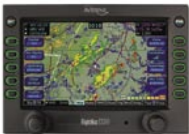
Avidyne's EX500 MFD

Avidyne has also introduced the capability to interface the EX5000 MFD with the popular Bendix/King RDR-2000 to display live weather on top of the map function. The system also supports the Vertical Profile function of the RDR-2000. By replacing a stand-alone radar display with the EX5000 MFD, pilots get sig-