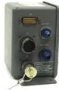
J2 Inc.'s 24471 Digital Air Data Computer

Everyone wants RVSM and everyone knows RVSM installations are complex and expensive. Well, J2 Inc. has introduced the new 24471 compact Digital Air Data Computer designed to bring RVSM accuracy and expanded interface capabilities to a wide range of business, regional and commercial aircraft at a lower