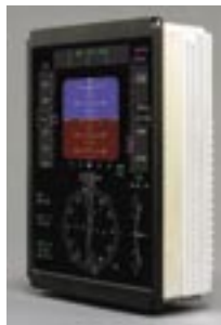
Innovative Solutions & Support's flat panel PFD/MFD unit

The new IADDU is unique in that the unit combines the analog interface into the standard ADDU, eliminating one-piece of a complex RVSM installation. The unit provides a dedicated display of Baro and Static Source Error Corrected altitude, altimeter setting number, and selected altitude, in combination with an electromechanical pointer move-