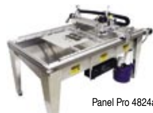
Panel Pro 4824a

When your drawing is ready, the SC2b controller automatically turns your CAD files into motion. The system can cut a standard 48 inches x 24 inches panel in one set up and in around a half-hour or it can be used to fabricate a variety of other complex sheet metal parts. Suggested list price is $14,995 (not including PC). For more information: (701) 255-7640 or visit www.bullerent.com . ■