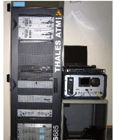
This data concentrator sends information to an aircraft controller’s console.