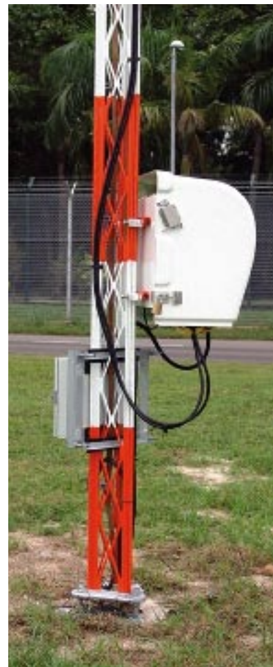
One of many combined remote ADS-B and multi-lateral receivers installed at equipped airports.