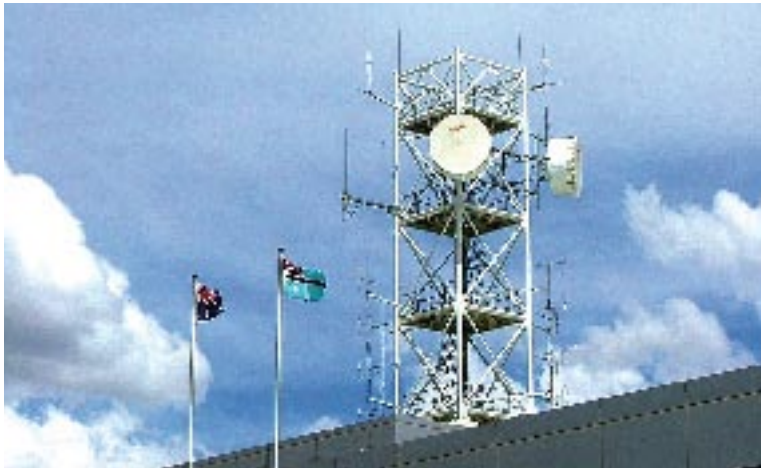
This receiver and antenna system is installed at a field in Germany.

way, aircraft could receive traffic information without relying on controllers or equipment on the ground. But UAT cannot receive signals from 1090ES units, and vice versa. To compensate, ground stations in the U.S. will process the combined data before it is broadcast so it will be usable by both types of units.