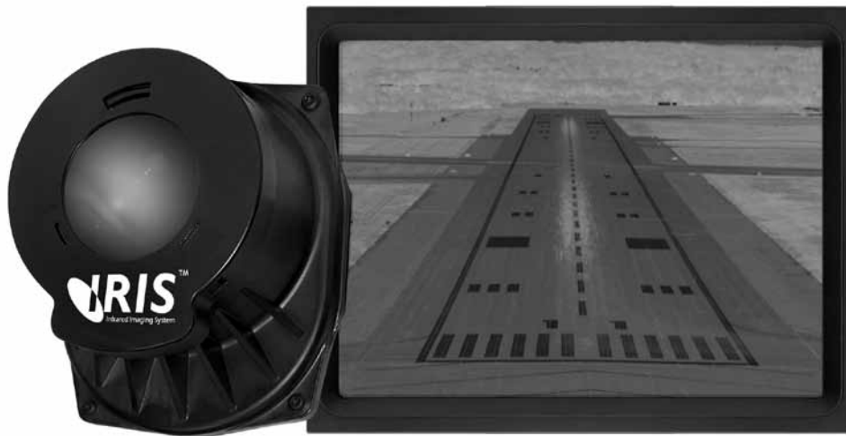
L-3 Avionics Systems' IRIS long-wave system was introduced in 2006.