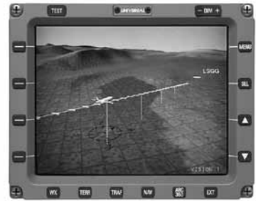
An exocentric view from Universal Avionics' Vision-1 SVS technology.

The view on the PFD needs to be seamless and consistent with the aircraft's position, making the display update rate an important consideration. The