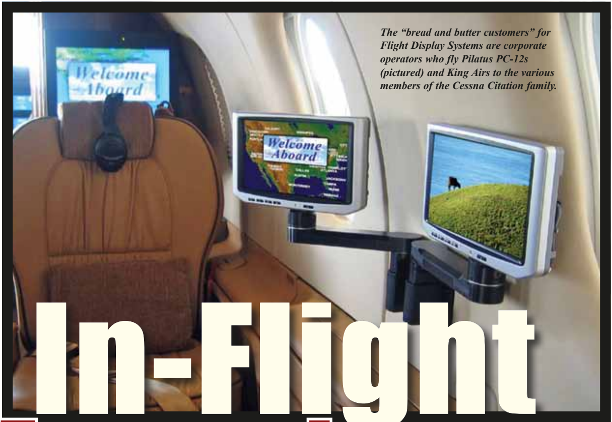
The “bread and butter customers” for Flight Display Systems are corporate operators who fly Pilatus PC-12s (pictured) and King Airs to the various members of the Cessna Citation family.