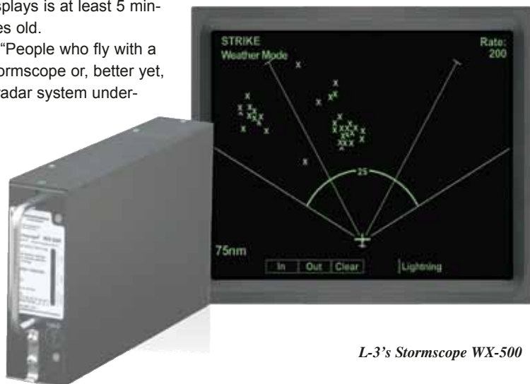
L-3's Stormscope WX-500

"I think data-link is definitely a complement to an on-board system — not a replacement. The ideal situation is to use all three systems in combination to get a more accurate presentation of the weather," he said. "Sometimes, amongst the users, there can be an over-reliance on the data-link weather. That's one thing we